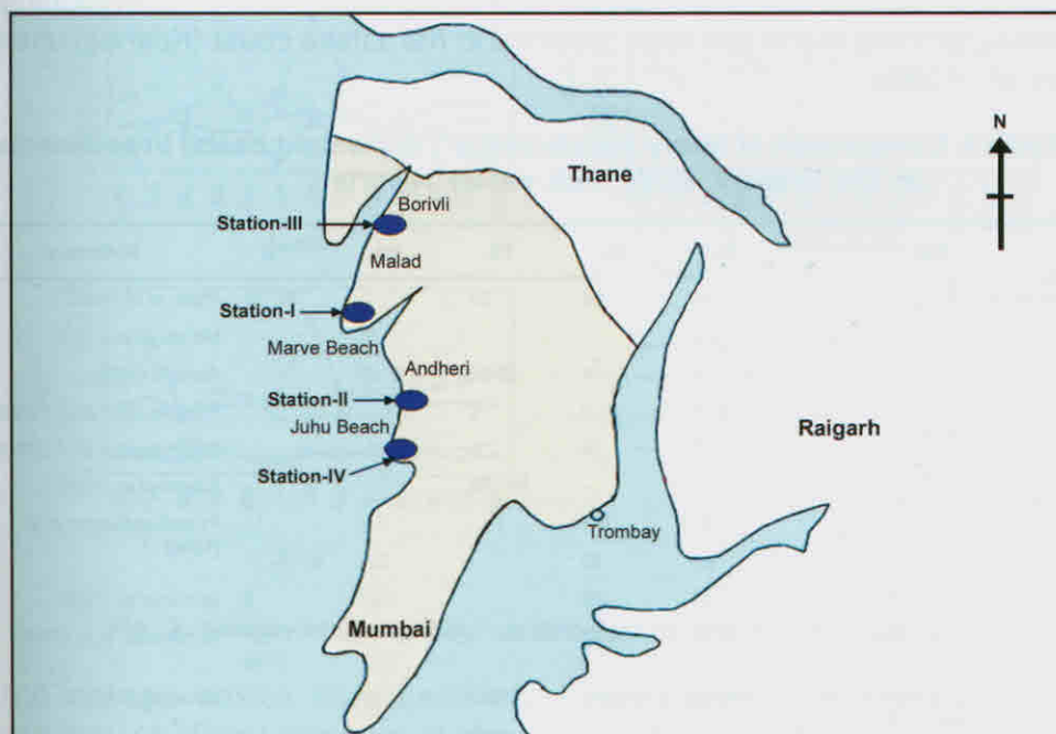
Fig. 1. Location of sampling stations at Mumbai Coast

while station III was located on a creek and Station IV was a site near a fishing village (Fig. 1). The sediment in stations I and II was sandy, while Station III had clayey soil and at Station IV, it was clayey-loam. Sediment samples were collected during low tide and placed in polyethylene bags and transferred to the laboratory in ice. Sediment samples were processed and analyzed as per the procedure of Tam and Yao (1999), and analyzed in a flame atomic absorption spectrophotometer (ECIL 4129, India). The results were presented in \text{mg.g}^{-1} , on dry weight basis.