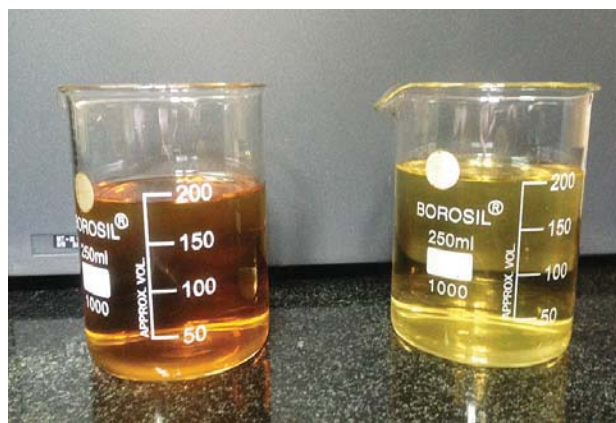
Fig. 1. Tuna red meat protein hydrolysate and tuna white meat protein hydrolysate

Evaluation of the protein hydrolysate functional properties viz. foaming properties and emulsifying properties revealed comparatively higher functionality for TWPH. Foaming capacity of TWPH and TRPH were 85 \pm 5\% and 75 \pm 5\% , respectively and foaming stability at 3 min. was