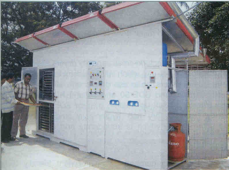
Fig. 9: Solar dryer with LPG back-up

dried using solar energy and when solar radiation is not sufficient as may happen during cloudy or rainy days, LPG back-up heating system will be automatically activated to supplement the heating requirement. This machine is ideal for drying fish, fruits, vegetables, spices and agro products hygienically and efficiently. The drying rate is faster and product quality is better compared to open drying in the sun.