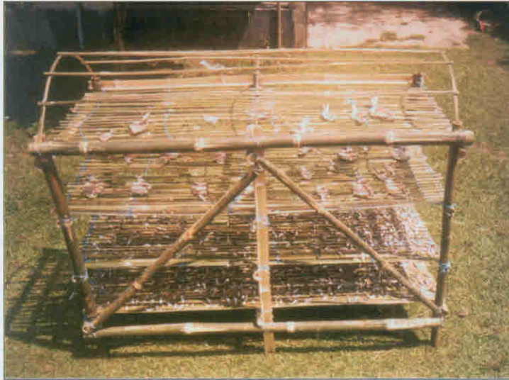
Fig. 2: Rack dryer

emission. Solar heating system is the most viable option as it is cost effective and eco-friendly.