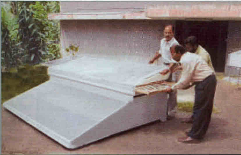
Fig. 6: Forced circulation dryer

A forced circulation fish dryer was developed with UV resistant plastic covering (Fig. 6). Air is heated in a heat collector and the hot air is passed through a chamber with forced air circulation system. Photovoltaic panels are provided in the system so as to regulate the flow of air in accordance with the intensity of solar radiation obtained during the drying process. Battery back-up system is incorporated in this dryer.