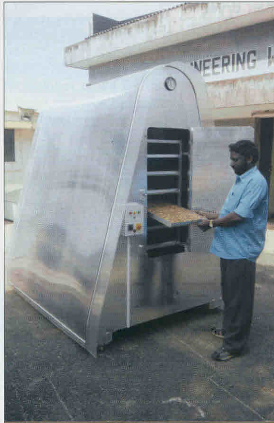
Fig. 7: Multipurpose solar dryer

back-up heating system with hot air circulation facility and well insulated design to avoid wastage of thermal energy are the added advantages of this dryer. Continuous flow of hot air is maintained with the help of photovoltaic cells and fans to enable faster drying rate. During sunny days, fish will be dried using solar energy and when solar radiation is not sufficient during cloudy or rainy days, electrical back-up heating system will be automatically activated to supplement the heating requirement. Thus, continuous drying is possible in this system to obtain a good quality dried product. Complete protection against weather, dust, insects, birds and rodents are achieved in this type of dryers.