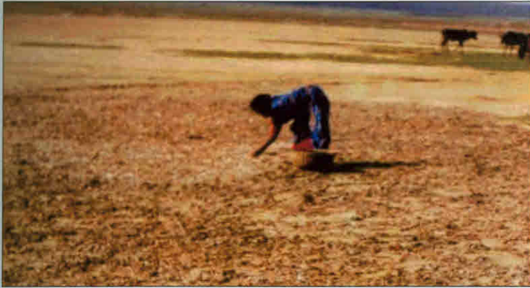
Fig. 1: A view of traditional sun drying of fish in open beaches