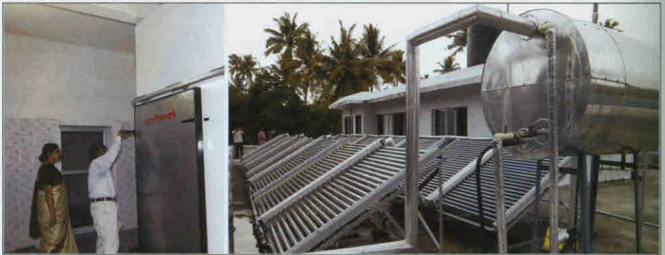
Fig. 10: CIFT dryer SDL-250 (right: dryer chamber; left: roof-top solar panels and hot water reservoir

A 250 kg capacity hybrid solar fish dryer developed with LPG/ biogas back-up heating system is shown in Fig. 10. One such dryer was installed at the Fish Processing Centre, Kattoor, Mararikulam South under MEDICOM-SGSY special project technology transfer scheme being implemented by Aryad and Kanjikkuzhi Block Panchayaths of Alappuzha district. In the solar fish dryer with LPG back-up heating system, water is heated with the help of solar vacuum tube collectors installed on the roof top (Fig. 10) and circulated through heat exchangers provided in the polyurethane foam (PUF) insulated stainless steel drying chamber. When solar radiation is not sufficient, LPG back-up heating system will be automatically activated to supplement the heat requirement, enabling continuous drying.