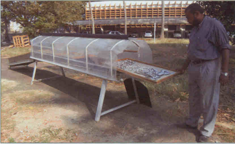
Fig. 4: Natural convection type dryer