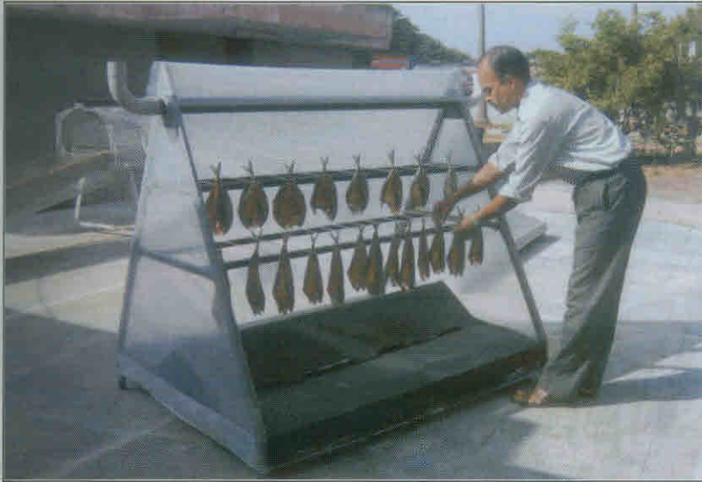
Fig. 3: PVC tent solar dryer

by using coal tar filled base platforms to absorb and retain thermal energy even after sun shine hours. The advantages of this type of dryers are their low construction costs and simplicity of operation. However, like other types of solar dryer, there is relatively poor control over the relative humidity of the air in the dryer and, hence, poor control over drying rates.