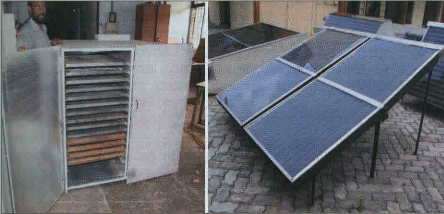
Fig. 8: Solar dryer with alternate electrical back-up heating system (Left: drying chamber; Right: solar collector panels)

dried using solar energy and when solar radiation is not sufficient as may happen during cloudy or rainy days, LPG back-up heating system will be automatically activated to supplement the heating requirement. This machine is ideal for drying fish, fruits, vegetables, spices and agro products hygienically and efficiently. The drying rate is faster and product quality is better compared to open drying in the sun.