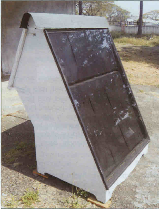
Fig. 5: Dryer for household use