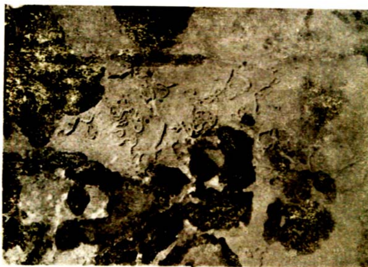
Fig. II. Marine fouling on over-protected copper sheathing.

limit making copper virtually non-toxic and hence fouling occurs. Fig. II shows such a phenomenon of inactivation of copper where the copper sheathing has been fouled by tube worms as well as oysters (only impressions seen).