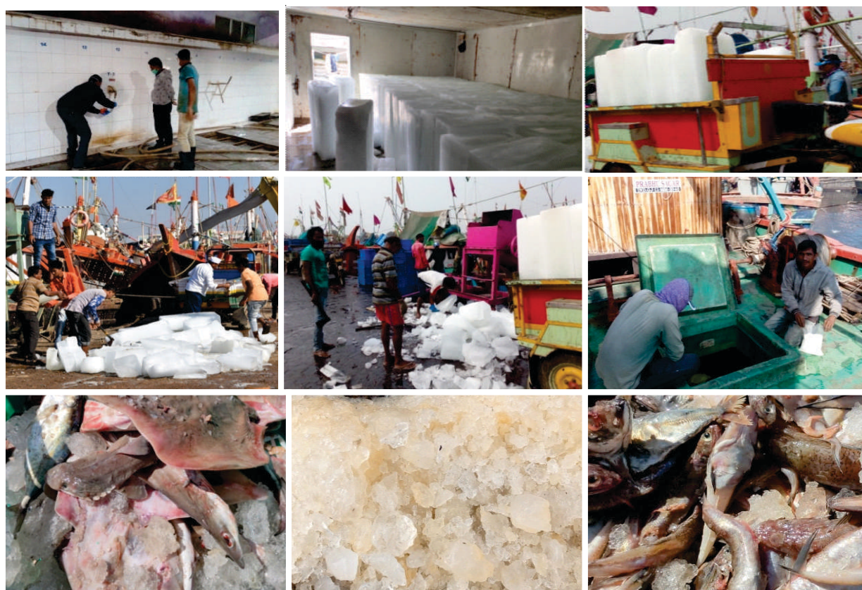
Fig: 1 Sampling points: water from iceplant, ice from ice plant, ice before crushing (after transportation), ice after crushing, ice from fish hold.

In conclusion, the study highlighted important sanitary issues in the distribution chain of ice used for fish preservation in Veraval. The ice used for refrigeration of fish can be a source of bacterial (pathogen) contamination. Only potable water shall be used for preparation of ice. Extreme care has to be taken in handling of ice during transportation and practices such as dragging of ice on contaminated floors should be avoided. Training on hygienic handling of ice shall be ensured for all the personnel involved in every stage of handling ice. There is need for strict monitoring by competent authorities for the improvement of quality of ice used for seafood preservation in Veraval, Gujarat.