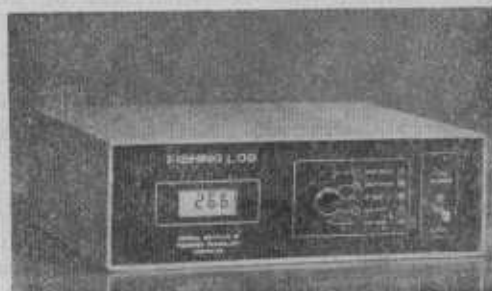
Fig. 2. Photograph of the receiver and display unit

Voltage developed across P-N junction of transistor is used to measure temperature. The element is encased in strong chamber for measurements in deeper waters. Two wire remote measurement, small size, suitability to hostile conditions and rough handling are special features of this sensor.