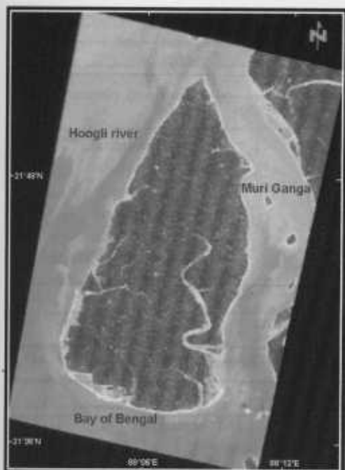
Fig 1: False colour composite of Sagar Island (IRS LISS III; October 1999)