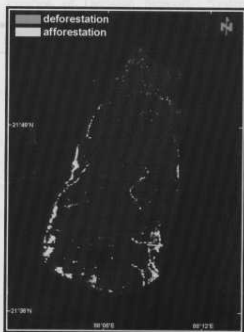
Fig 4: Changes in coastal vegetation of Sagar Island (IRS LISS III; December)