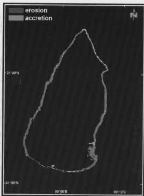
Fig 3: Shoreline changes of Sagar Island (IRS LISS III; December 1996 & October 1999)