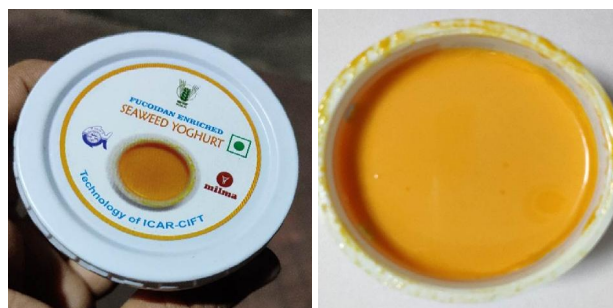
Fig.2 Seaweed supplemented yoghurt

The fucoidan incorporated healthy Yoghurt was prepared in collaboration with MLMA Products Dairy, Edappally, Ernakulam. Milk was thermized, standardized to required fat and solid non-fat levels and homogenized. The fucoidan powder along with sugar was admixed with milk. The admixture was pasteurized after the addition of pasteurized mango pulp. The mix was cooled and inoculated with thermophilic yoghurt culture comprising of Lactobacillus delbrueckii subsp. bulgaricus and Streptococcus thermophilus . The milk was agitated to uniformly disperse the yoghurt starter culture. The milk was filled in polystyrene cups and incubated at 42°C, until it attained the pH of 4.6. The yoghurt was cooled to 5°C before analysis. The proximate composition and anti-oxidant activities of seaweed supplemented yoghurt are presented in Table 1. The yoghurt samples were liked 'very much- extremely' on 9-point Hedonic scale, by sensory panelists.