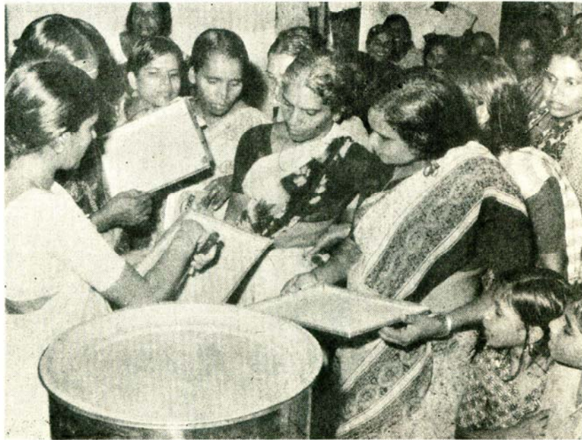
Preparation of fish wafers - at Kadungallur