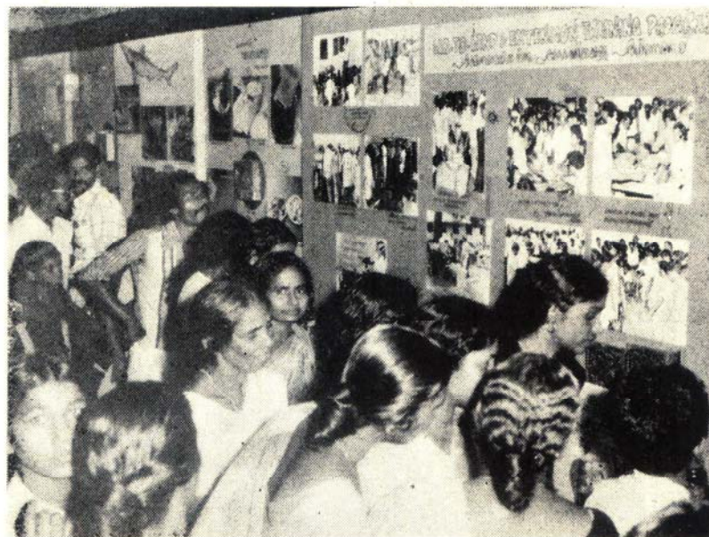
Another view of the stall