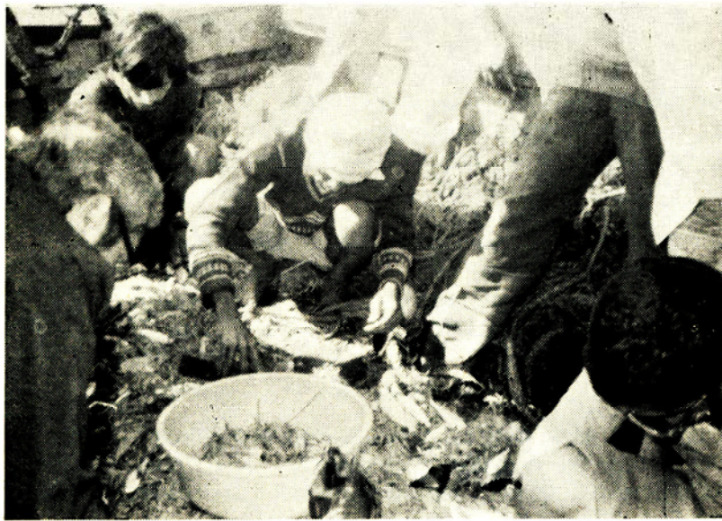
Demonstration on fish handling and preservation by ice on board fishing vessels at Veraval - sorting the catch on board a vessel