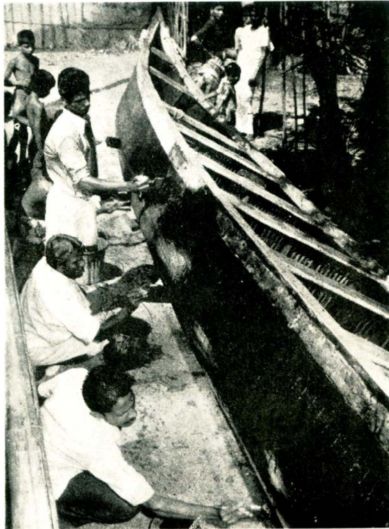
Application of the improved chemical preservative on a traditional craft in progress