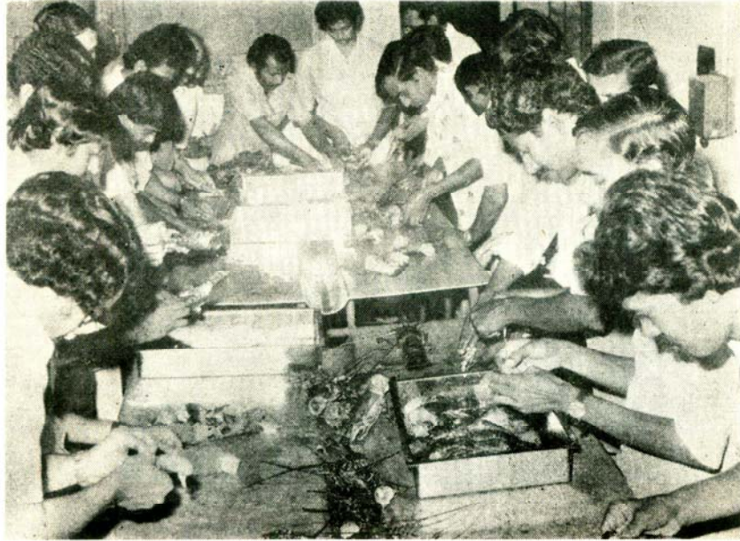
Training on processing lobster tails