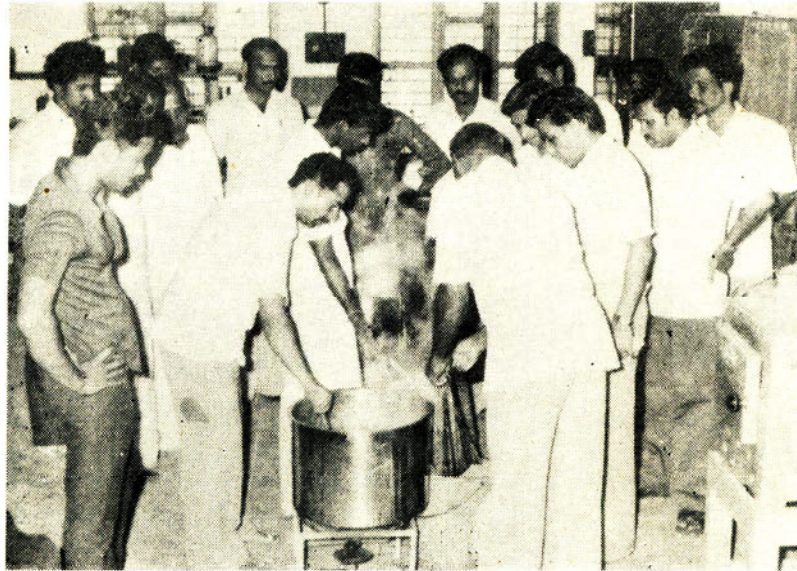
Extraction of sardine oil - at Malpe