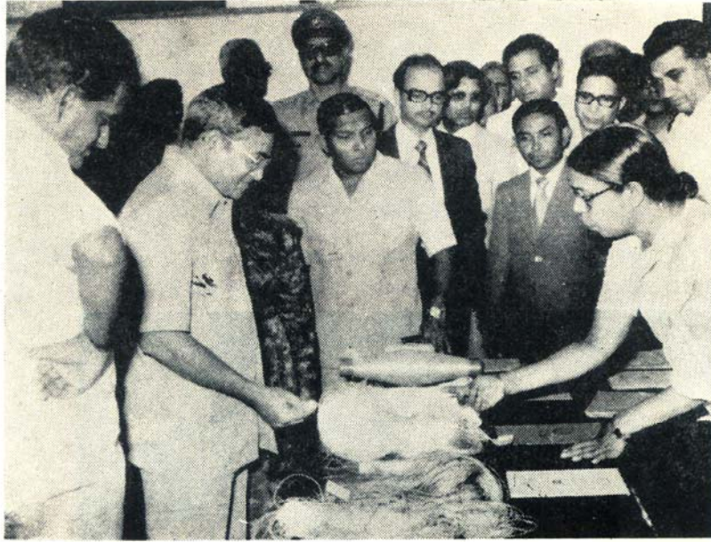
H. E. Mr. Abdul Gayoom, President of Maldives in the gear laboratory