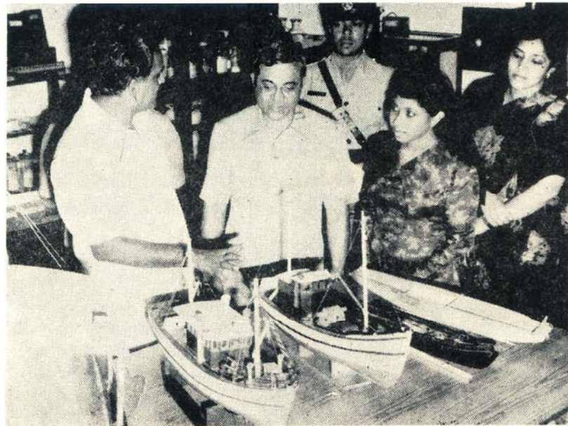
In the craft laboratory