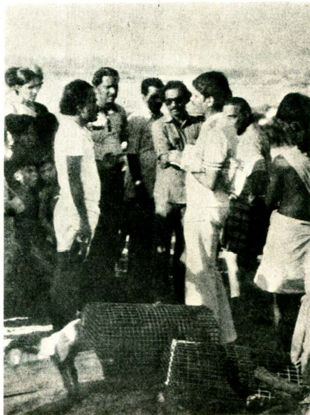
Training on lobster trap fishing - the participants being briefed on the operation of the gear