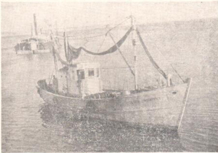
Fig. 1. Forty-nine footer combination boat