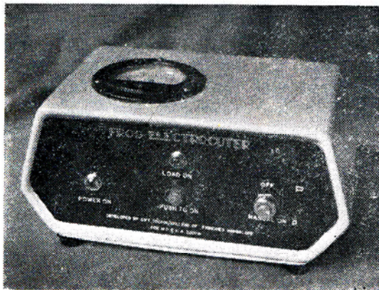
Timer unit (Fig. 2)

The plastic box has been replaced with fibreglass which is lighter, more durable and with better insulation properties. The box (Fig. 1) measuring 900x605x610mm. height can hold 500 frogs