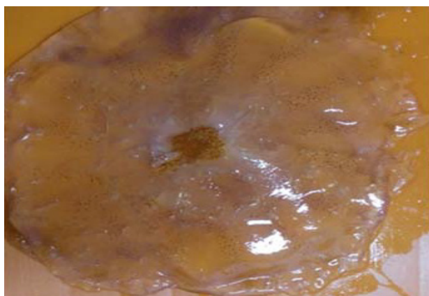
Figure 1. Jellyfish